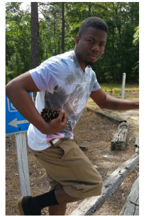
Davon Reaves former NFL player!