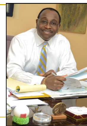
Commissioner Raymond Buxton, II

Si usted piensa que ha sido discriminado en la vivienda o en el empleo, debe ponerse en contacto con la Comisión de Asuntos Humanos. La Comisión investigará su queja si hay una violación de la ley, la Comisión puede ayudarle a conseguir soluciónes legales a los que usted tiene derecho. Si es necesario, la Comisión puede llevar casos de discriminación a una audiencia o a la corte. No importa su estado legal, la Comisión lo ayuda.